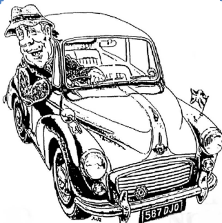
MORRIS MINOR OWNERS CLUB