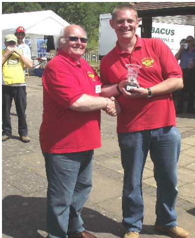
Prize winners shown on page 11