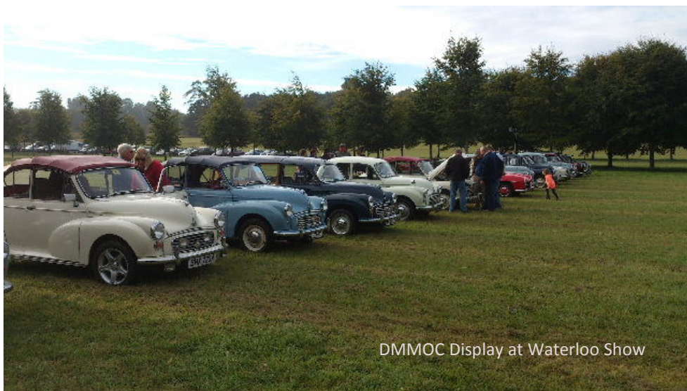
DMMOC Display at Waterloo Show