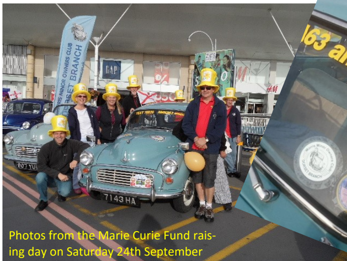
Photos from the Marie Curie Fund raising day on Saturday 24th September

The Mistletoe Meander is being arranged for 27th December (which is the Tuesday after Christmas) and a bank holiday. There should be an entry slip with the newsletter. The entry is £7 per head and includes coffee, mince pies, road run, fish and chip lunch with dessert. (Slips also available on the website).