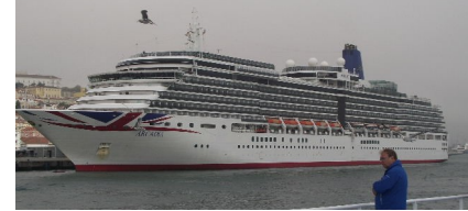
'Arcadia' parked-up in Lisbon

Thanks to Roger K for the latest article in the A-Z series—this month featuring your favourite seat belt and headgear manufacturer—Kangol. You will have to read it to find out what is going on with the 'Rear View' picture this month!