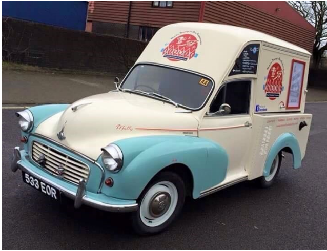
Spotted in Fareham: 'Molly' the Coffee Van