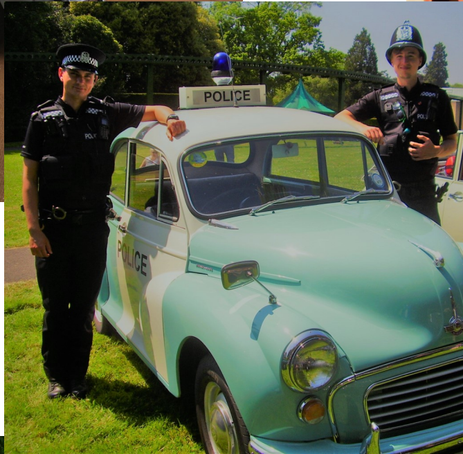
Members wore a variety of outfits appropriate to the various decades during which the Minor reigned, adding colour and interest to this happy aspect of the show