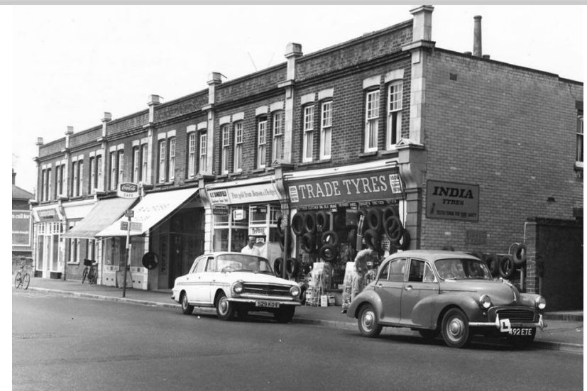
Wimborne Road, Bournemouth, 1970

Contact details: Alan Lock 01983 551014 or 07765 575458