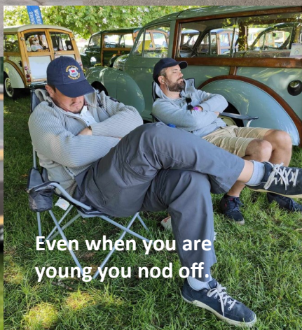
Even when you are young you nod off.