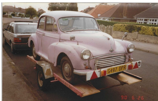
The Million being delivered in 1990

The story of this particular car, EOS 444 (1,000,330) however, began about a month earlier than the others, in late November 1960. The chassis number stamped on the bulkhead is 881,386 and it started out as an ordinary 2 door saloon. It was the first one to be sprayed Lilac and was prepared as the 'prototype'