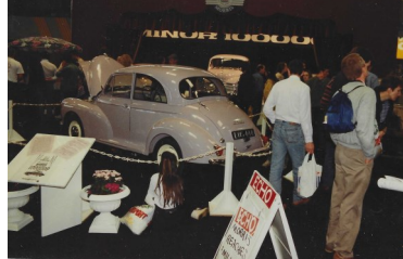
NEC Classic Car Show Nov 1993