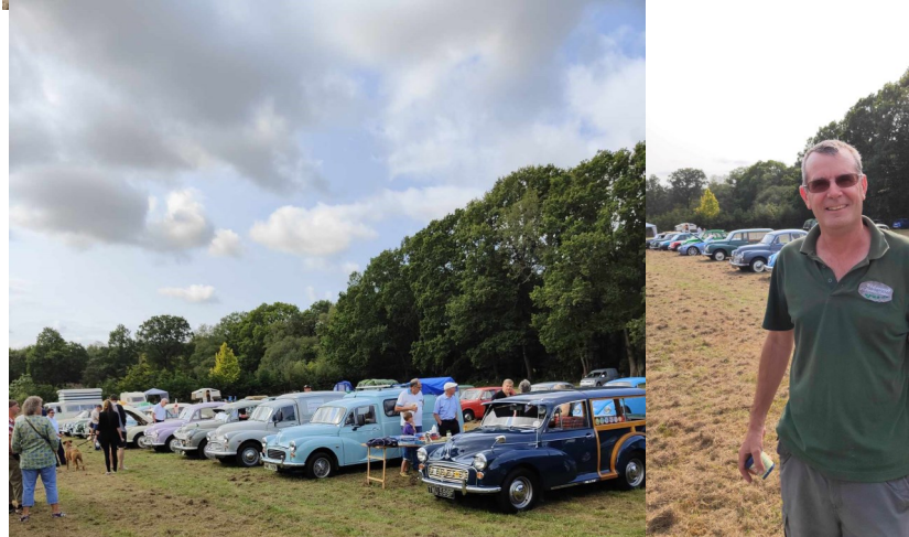
Some pictures from Wolvercroft. The team at the garden centre did us proud. Nice to see a wide variety of Morris cars plus some other makes that are always made welcome. We had nearly ninety cars in attendance on Sunday